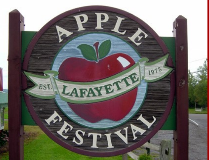
LAFAYETTE APPLE FESTIVAL OCTOBER 8TH AND 9TH, 2016

PLEASE DRIVE SAFE!!!!!!! PLEASE PAY ATTENTION TO THE SCHOOL ZONES, SCHOOL BUSES & PLEASE WATCH FOR STUDENTS CROSSING TO GET TO AND FROM SCHOOL.